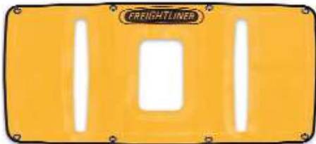
FREIGHTLINER BUSINESS CLASS NBPWF-1955Y

“Heavy-duty vinyl Winterfronts are GREAT for Cold weather. They protect radiators and grills from the elements. They are easily installed to bus fronts with Snaps or turn buttons (turn button hardware additional) CALL US TODAY TO ORDER YOURS 877-633-7278