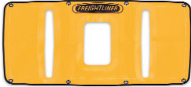
FREIGHTLINER BUSINESS CLASS NBPTH0398-YELLOW